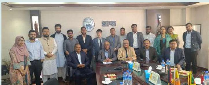
Orientation program of EMPG-5th Batch in Spring 2024

SIPG has continued the academic program EMPG, a one-year-long executive program that aims to enhance and strengthen the academic competence and professional skills of professionals from bureaucracy, development organizations, embassies, INGOs, NGOs, private sector officials, and fresh graduates of Bangladesh. The EMPG 5th batch commenced their classes in January 2024. Moreover, the EMPG 6th batch will be enrolled in the Summer 2024 semester.